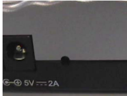
Example with reset hole.