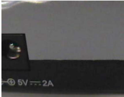
Example without reset hole.

See an example of the reset hole to see if it is present on your Access Point: