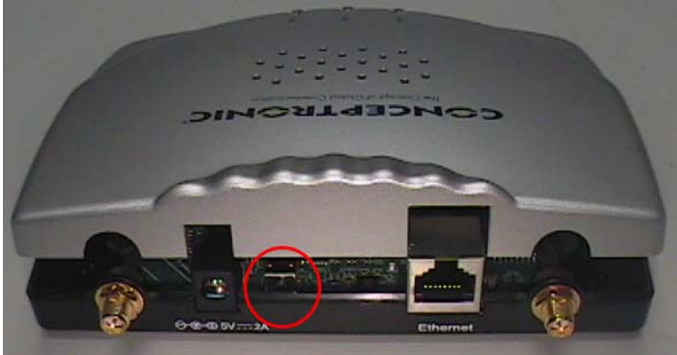
Detail of the reset button: